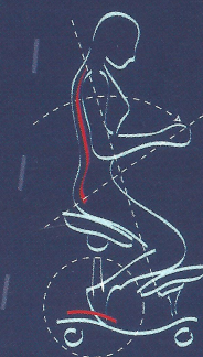
NIRVA 13 seat